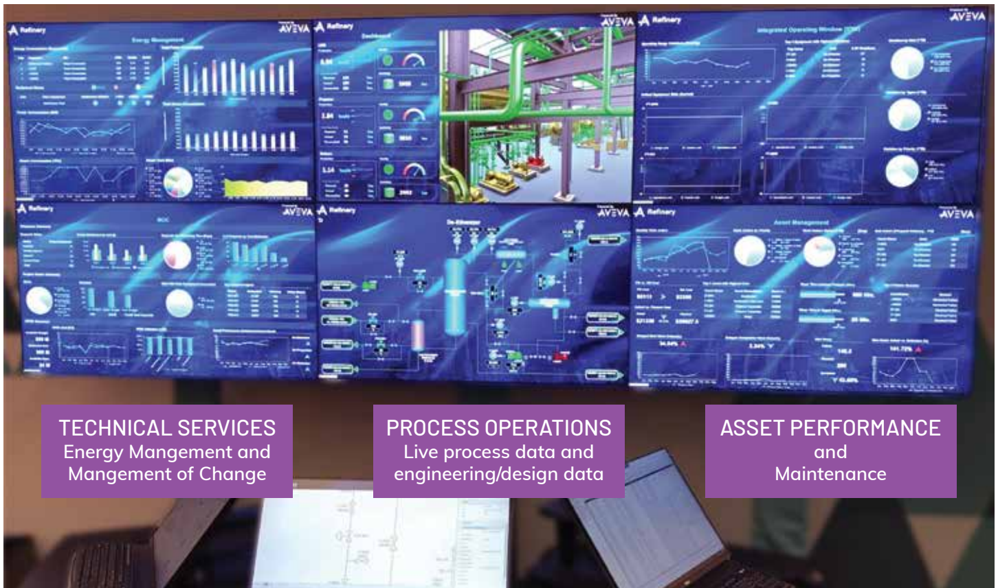
Integrated Collaboration based on Unified Operations Center