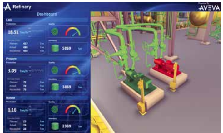
Unified Operations Center turns data into actionable information contextualizing 3D Engineering design with real-time Process data

The solution leverages existing data locked in multiple enterprise and operational systems to enable "fact-based" decisions. AVEVA's Unified operations center is based on a 'system of systems' approach. This enables seamless plug-in of apps, predictive and process analytics, CCTV video, GIS maps, ERP systems, Engineering P&ID diagrams and much more, all within the unified user interface.